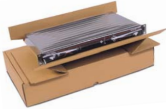
Engineered retention frame provides additional bottom cushioning for heavy and fragile items.

Korrvu® Retention Packaging provides a variety of engineered solutions for products that need protection from shock during the distribution cycle.