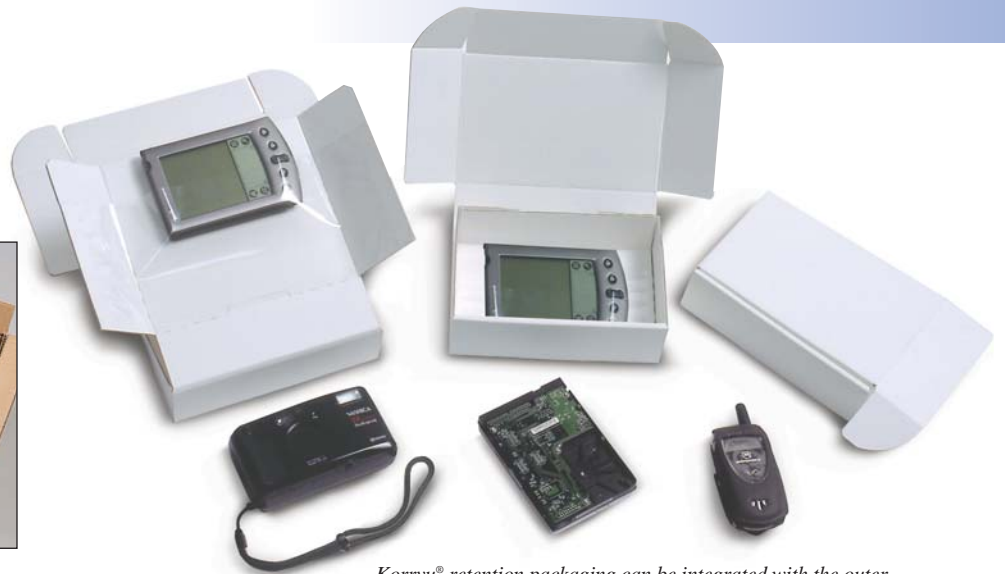
Korrvu® retention packaging can be integrated with the outer carton and printed for an 'all in one' packaging solution.