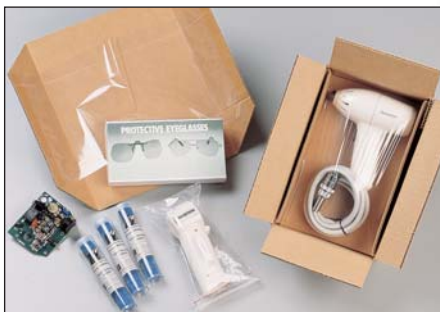
For these applications, the flexible retention film accommodates a wide variety of spare parts and accessories.

Korrvu® retention packaging is a versatile, economic alternative to traditional packaging.